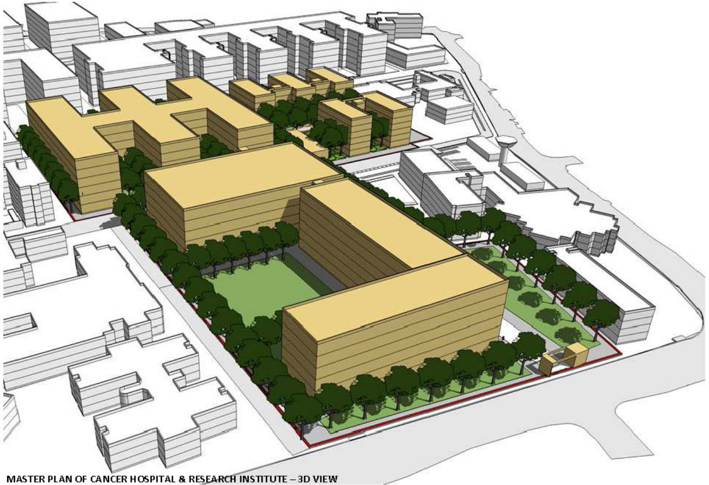
MASTER PLAN OF CANCER HOSPITAL & RESEARCH INSTITUTE – 3D VIEW